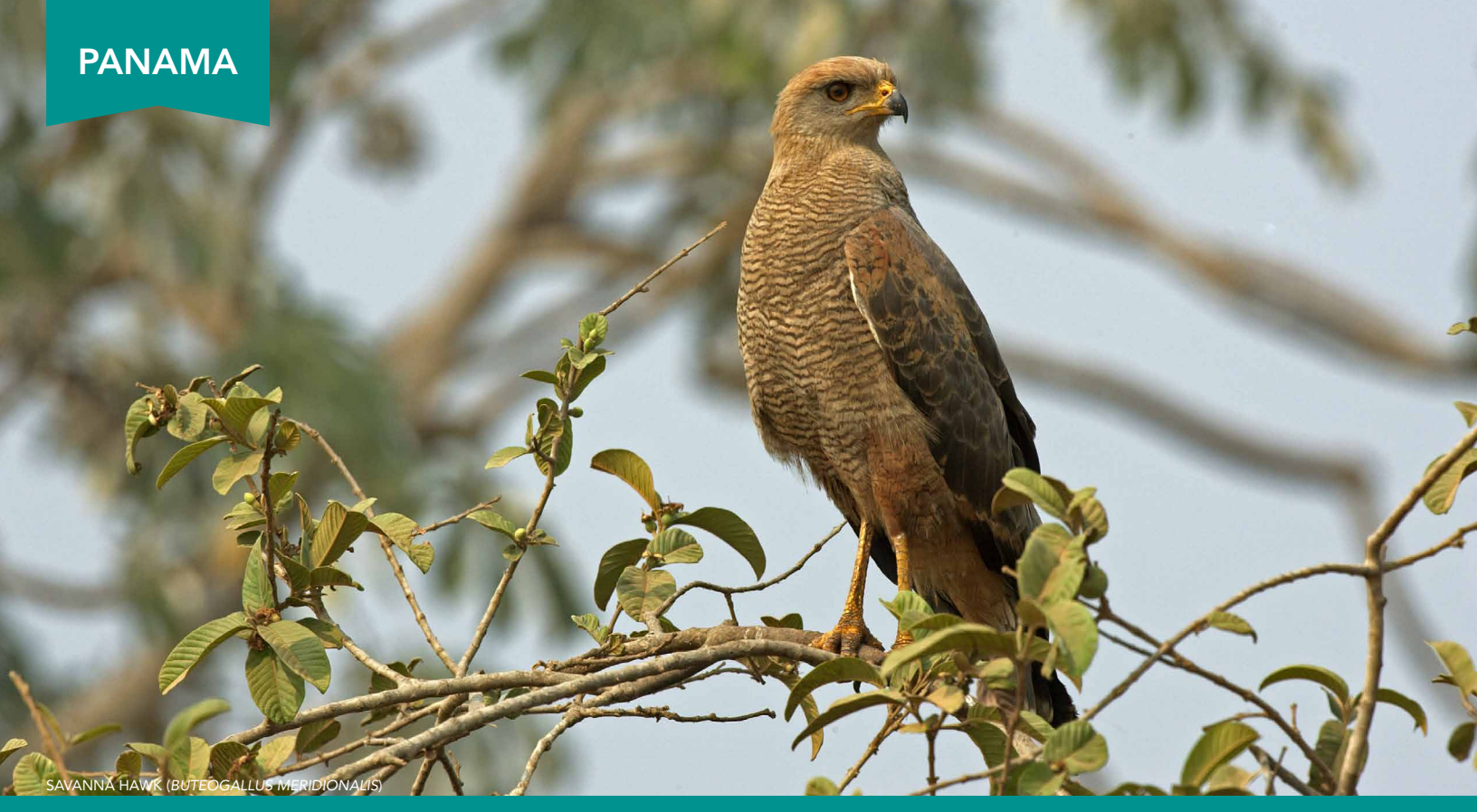
SAVANNA HAWK (BUTEOGALLUS MERIDIONALIS)